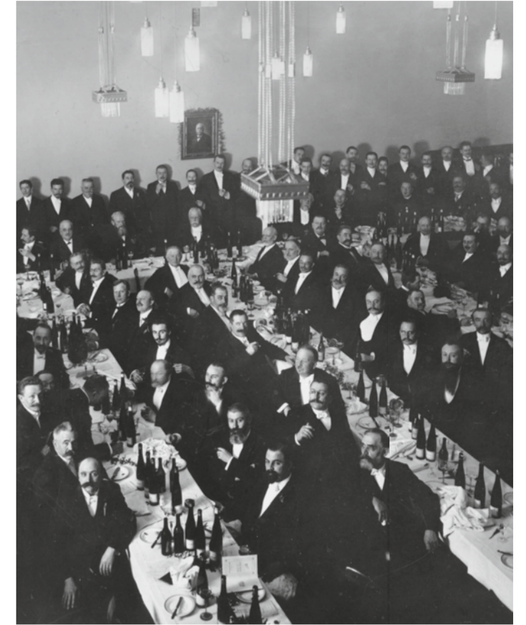
Banquet to mark inauguration of the new house, January 1910