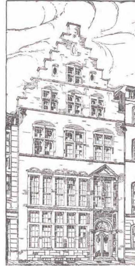
Society building on Niederstraße, built in 1909