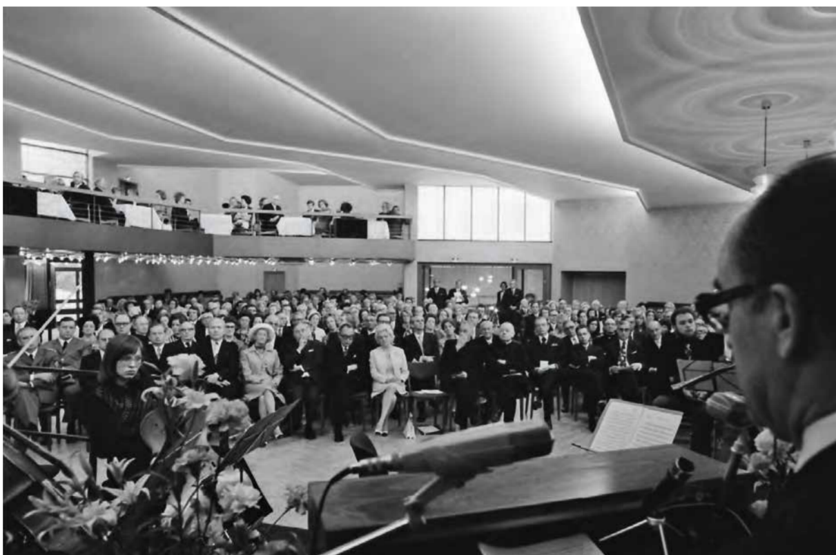
Inauguration of the community centre, 1974