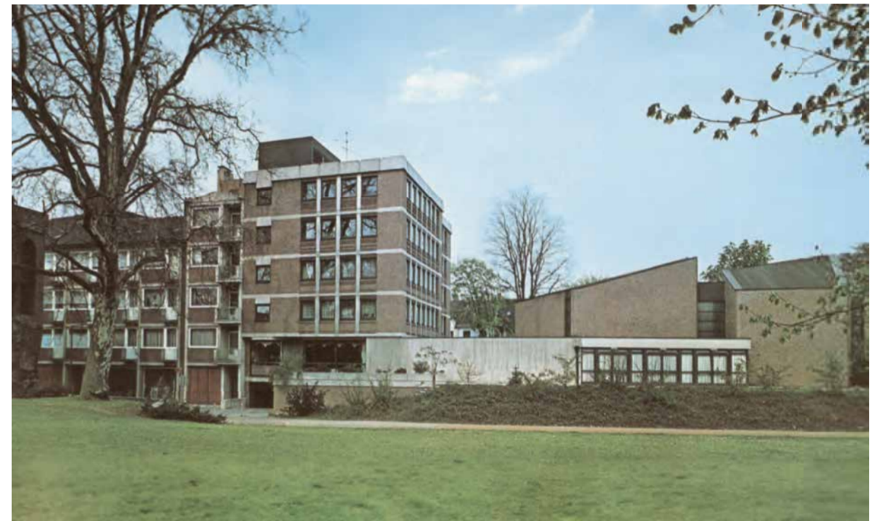
“Bürger” community centre with office building and hall, 1974